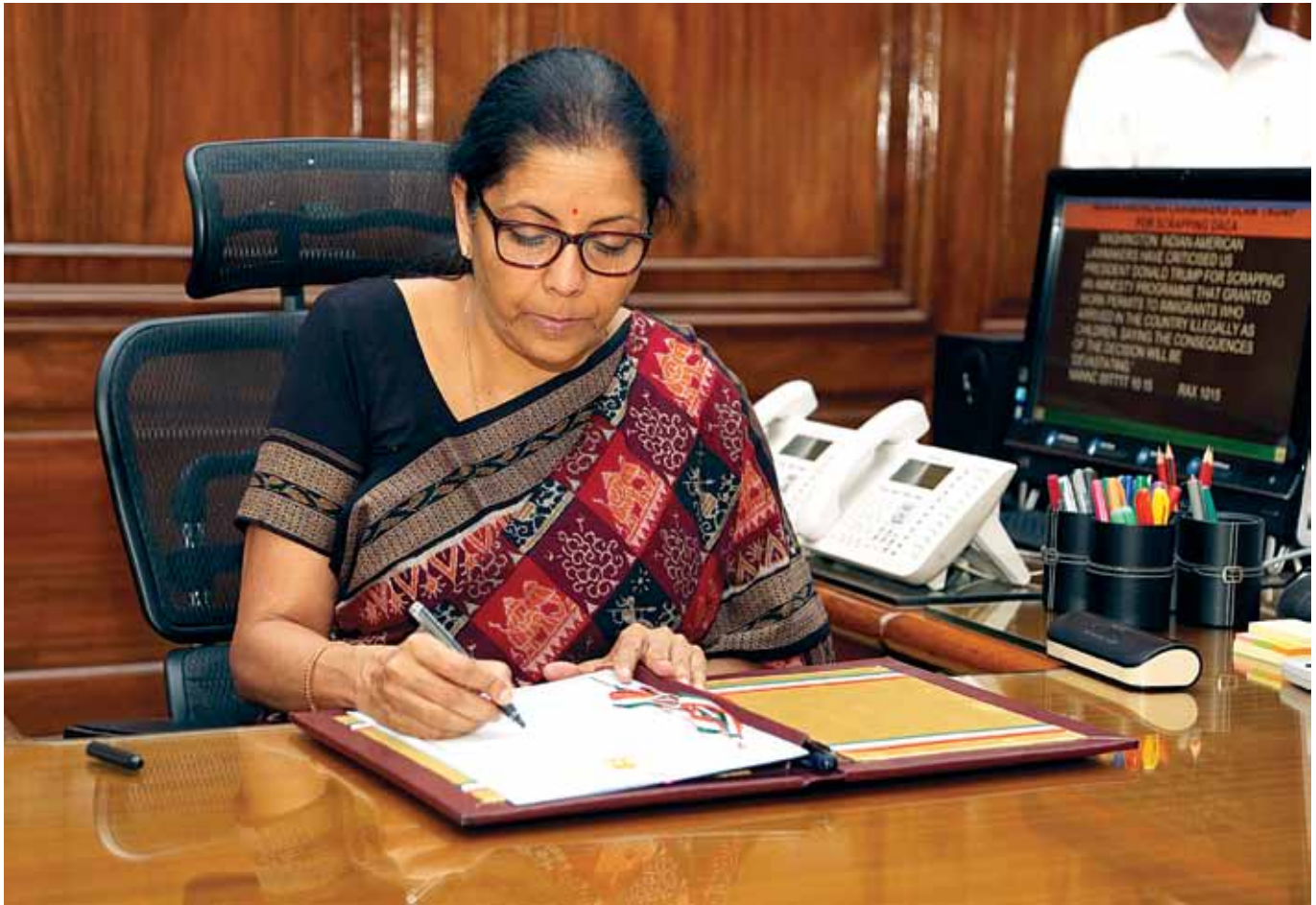
Taking Charge: Nirmala Sitharaman is India's new Defence Minister