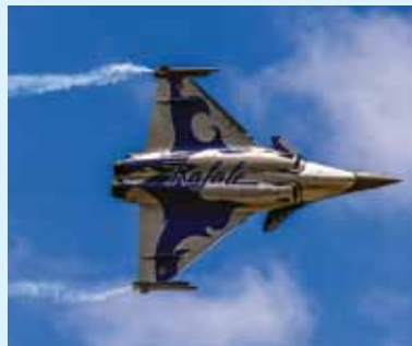
Game Changer: Rafale fighter aircraft

responded in any Humanitarian Assistance and Disaster Relief (HADR) operations way beyond their call of duty.