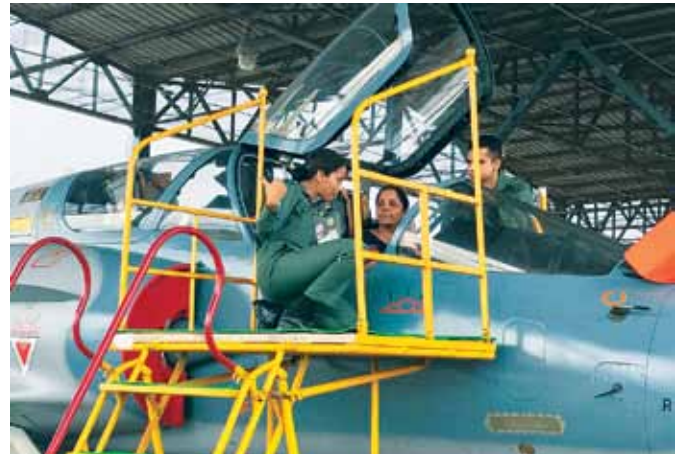
Hands On: (Left) Defence Minister in Naliya Air Base, Gujarat and (right) in the cockpit of a Mirage fighter at Air Force Station in Gwalior.

robotics, artificial intelligence, stealth, precision fire, and ability to hit the adversary deep inside its territory through the entire spectrum of conflict, including the sub-conventional. It is imperative that the military be closely integrated into the national space and cyber programs, not kept aside as is the case presently.