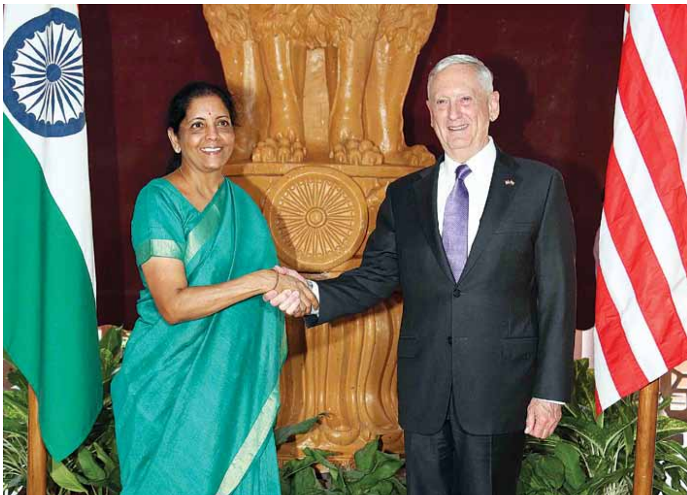
Forging Ties: Defence Minister Nirmala Sitharaman with the US Secretary of Defence James Mattis in New Delhi

To win Indian hearts and minds, Mattis talked of steadily expanding defence cooperation, underpinned by a strategic convergence based on common objectives and goals in the region