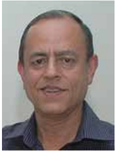
LT GENERAL P.C. KATOCH (RETD)